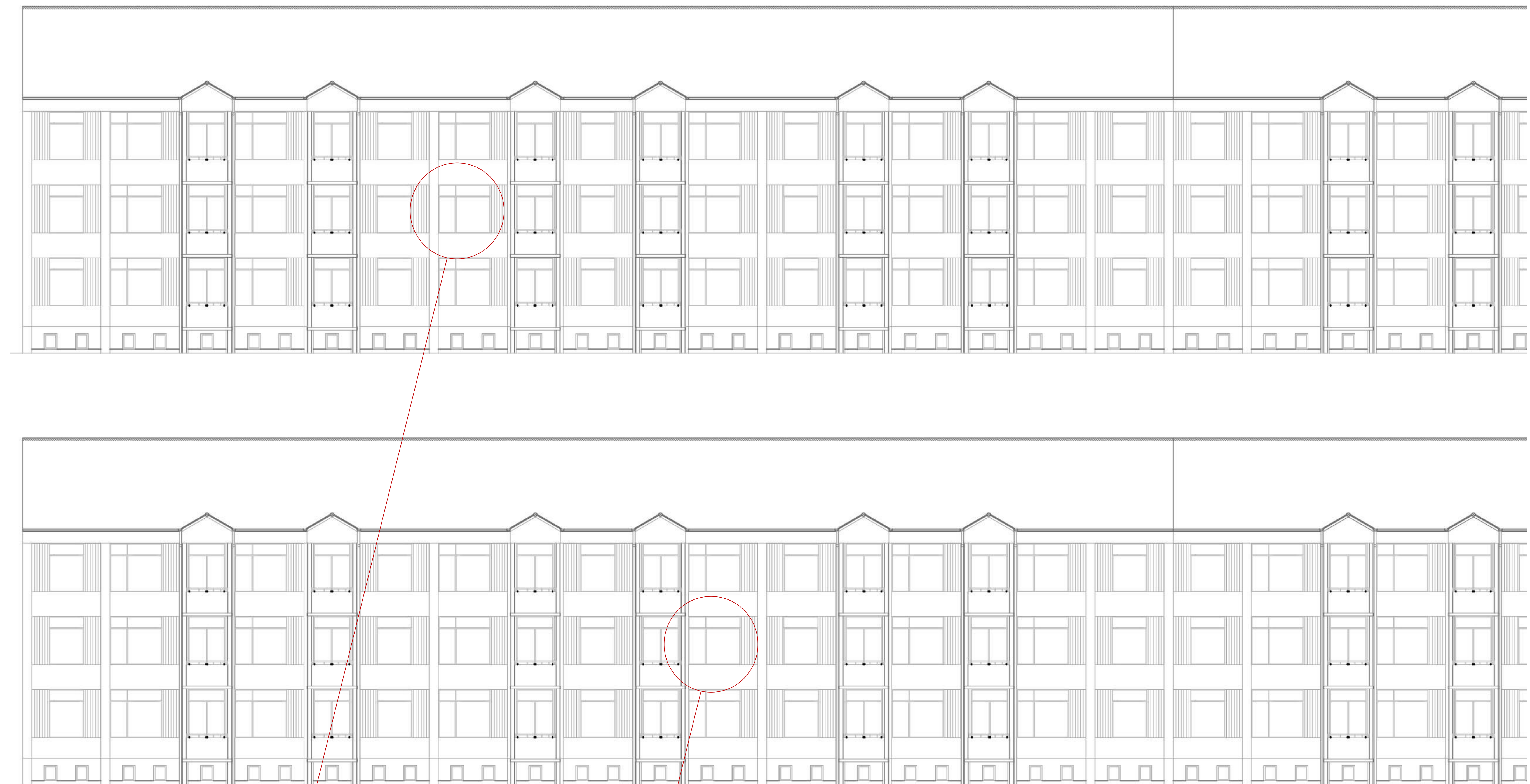
Fig. I. The Public Housing HAB, Haderslev, DENMARK, experimental block (top) and control block (bottom)